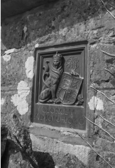
Plaque with heraldic device on one of the two entrance pillars at the playing field. The other plaque has a unicorn

one was to have a specially-designed heraldic shield, supplied by the Foundation, fixed to it.