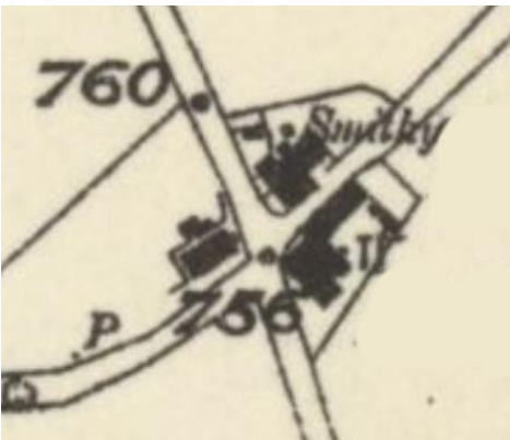
1883 Ordnance Survey map showing the layout at the village smithy