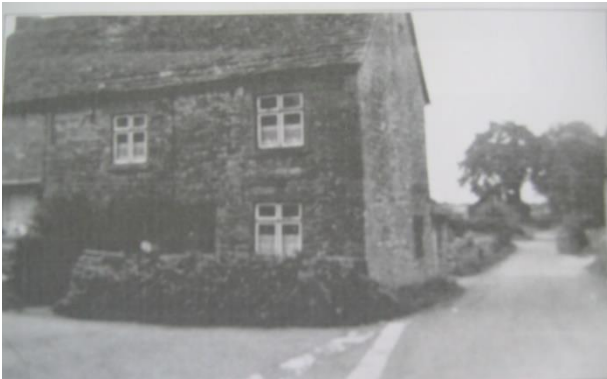
Photo looking down Tinkley Lane from The Cross around 1950. The smithy forge was behind the house. Note the road markings.

between Gloucester and Bath once followed the old Roman Road through the centre of the village and that extra horses were needed to take carriages up and down the notorious Frocester Hill, one can see how well placed it must have been - right there on the crossroads.